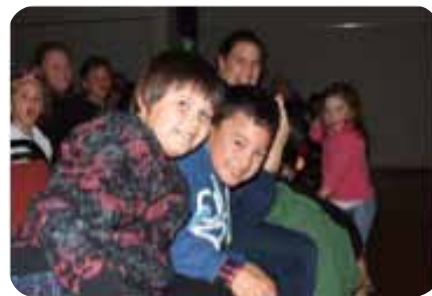
Happy faces were a feature of every audience